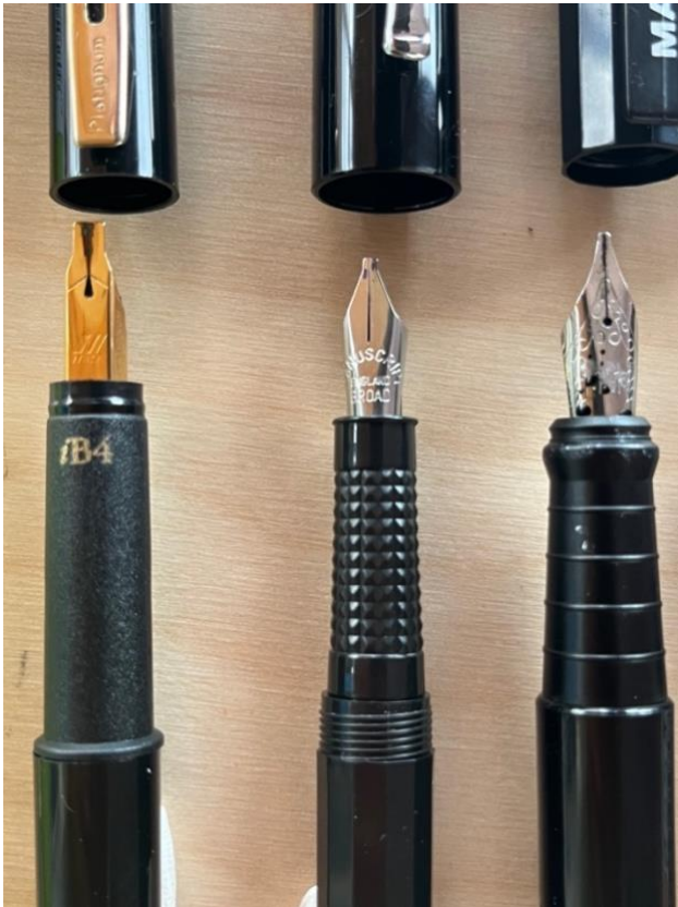
Fig. 1: Calligraphy Pens with Broad Flexible Nibs